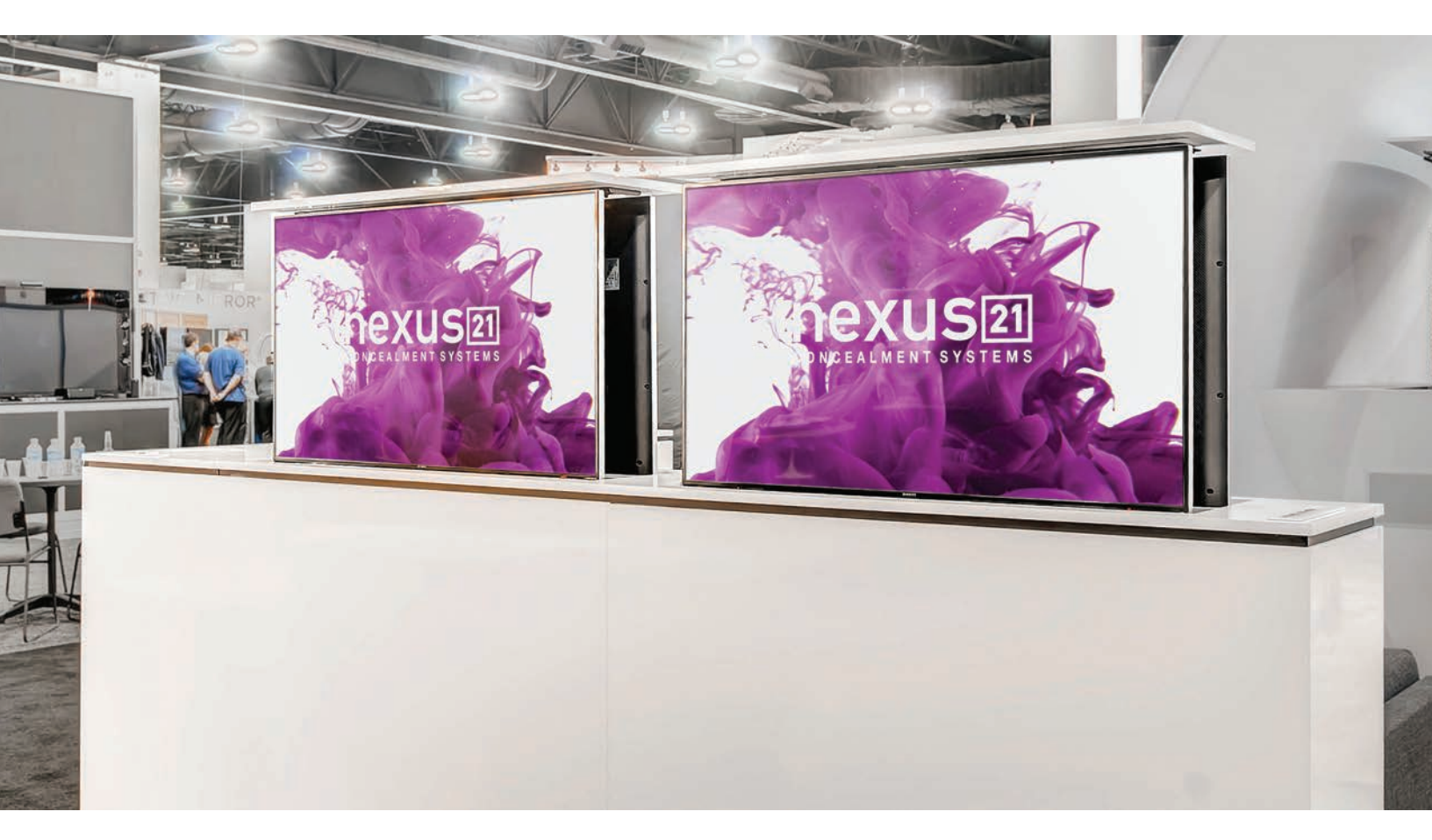
Nexus 21 solutions come complete with everything required for assembly and installation. Motorized systems are covered by a 10-year warranty and all products are backed by our world-class product support team.